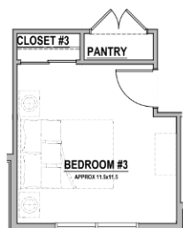
Bedroom #3 Upgrade Option